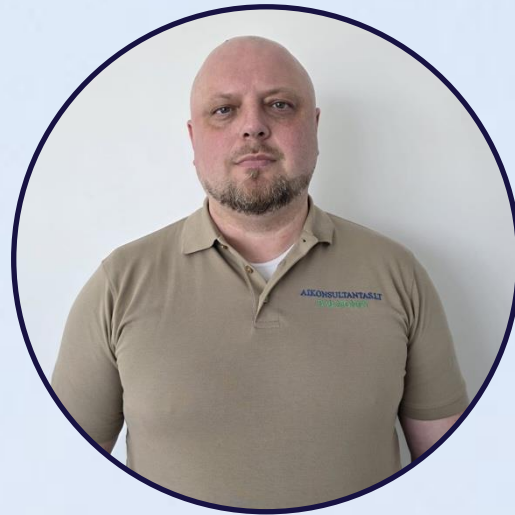
Jurij Customer Support