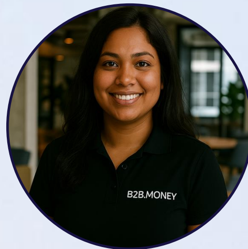
Ms. Cold Outreach AI Assistant