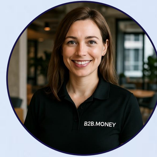
Ms. Sales Concierge AI Assistant