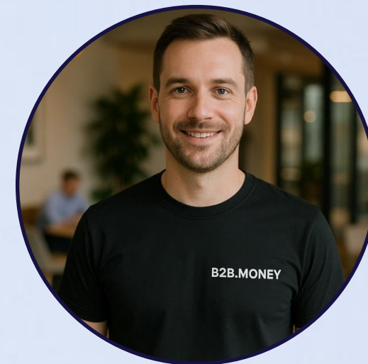
Mr. LeadGen AI Assistant