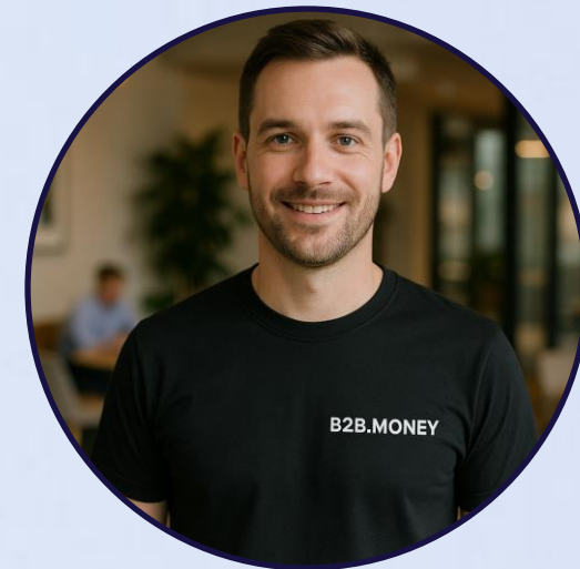
Mr. LeadGen AI Assistant