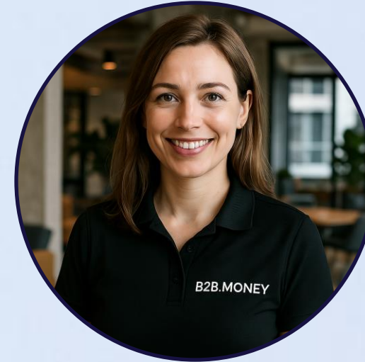
Ms. Sales Concierge AI Assistant