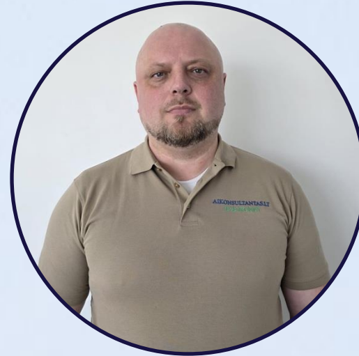
Juri Customer Support