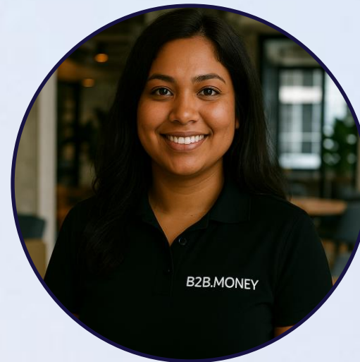
Ms. Cold Outreach AI Assistant